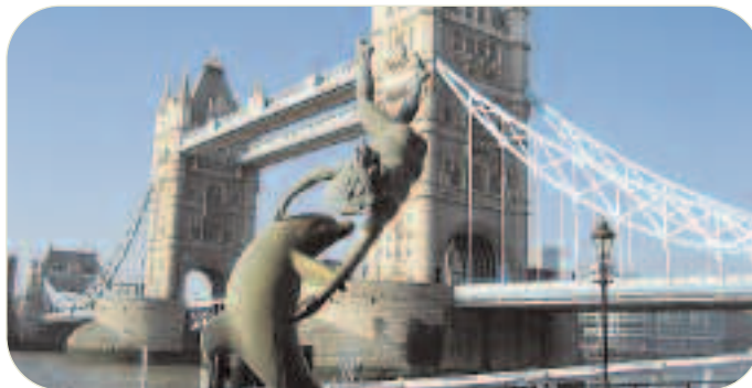
Convention participants enjoyed a spectacular view of Tower Bridge from their hotel.